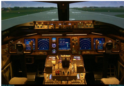
Your Office !! 2

If so, call or e-mail your service request now !!